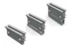
Standing seam clamps