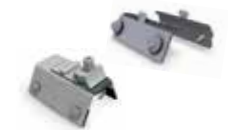
Fastening of solar plants on trapezoidal sheet metal roofs