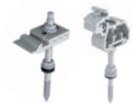
Kits for corrugated roofs